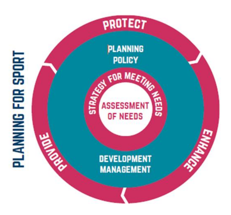
Figure 3.1: Sport England themes